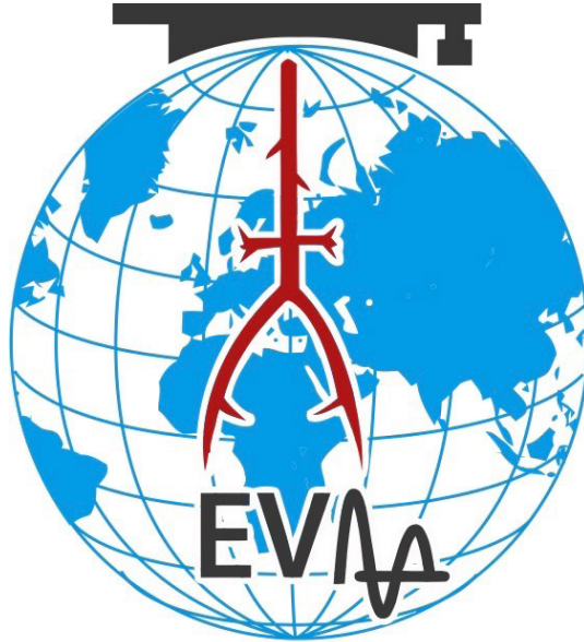
Egyptian Vascular Academy

The Kasr Alainy Vascular Symposium would like to thank the Egyptian Vascular Academy for its continuous and unlimited support to all scientific activities in Kasr Alainy, and in particular its sponsorship to the Kasr Alainy Vascular Symposium.